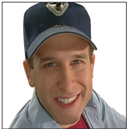
Non-Scientists (84% of survey respondents)